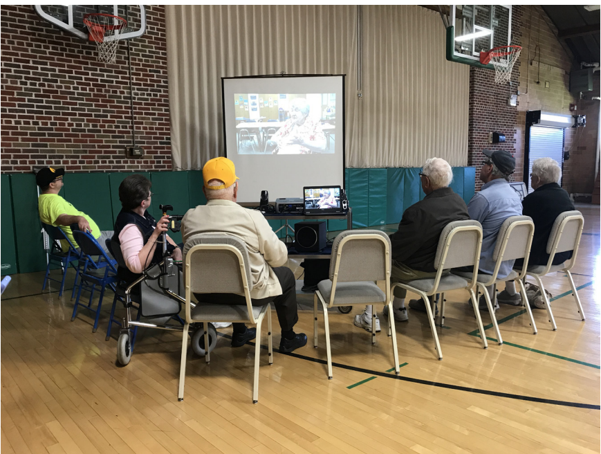
Top: A completed accordion book made by a Delwood student; Bottom left: Open house vguests isiting with students about their books; Bottom center: A Delwood students working on her accordion book; Bottom right: Delmar residents watching the final videos at the Open House.