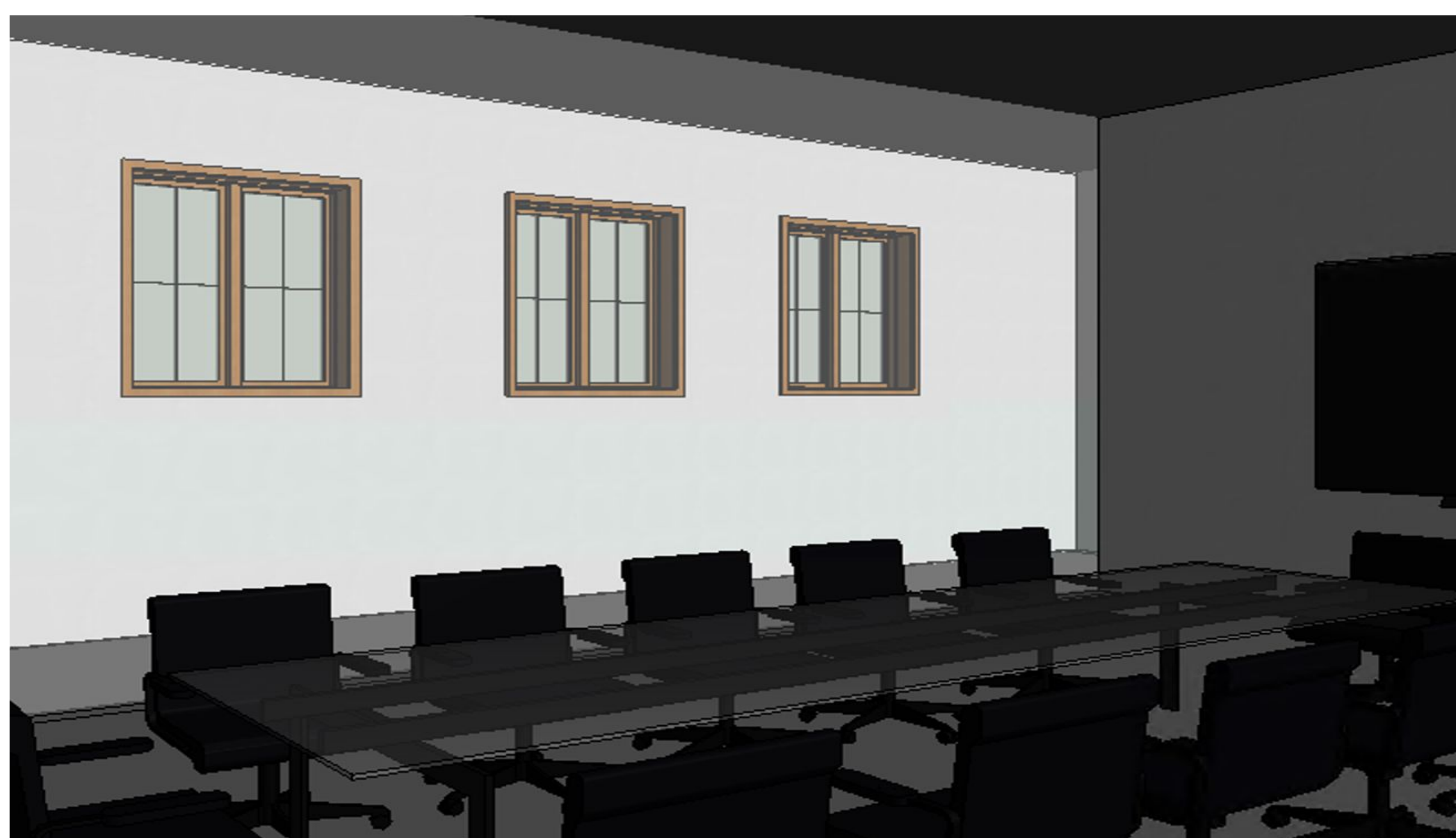
Figure 3. A typical second floor office or meeting space.

The community representatives emphasized the need for lodging in Volga, which is why the third floor will be partitioned into six bedrooms, a common area, and pod-style bathrooms.