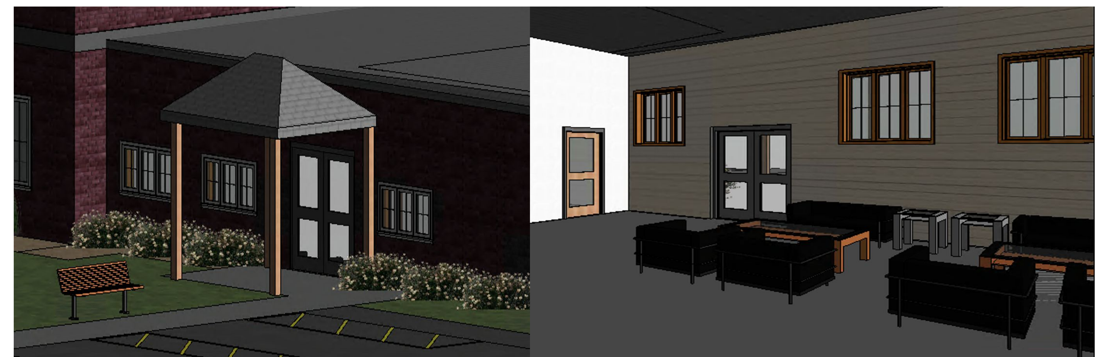
Figure 2. The proposed main entrance and lobby on the south side of the building.

A new entrance connecting the gymnasium to the first floor school building will be added, along with a main lobby for welcoming visitors.. The kitchen will be relocated with laundry units for use by guests and community members.