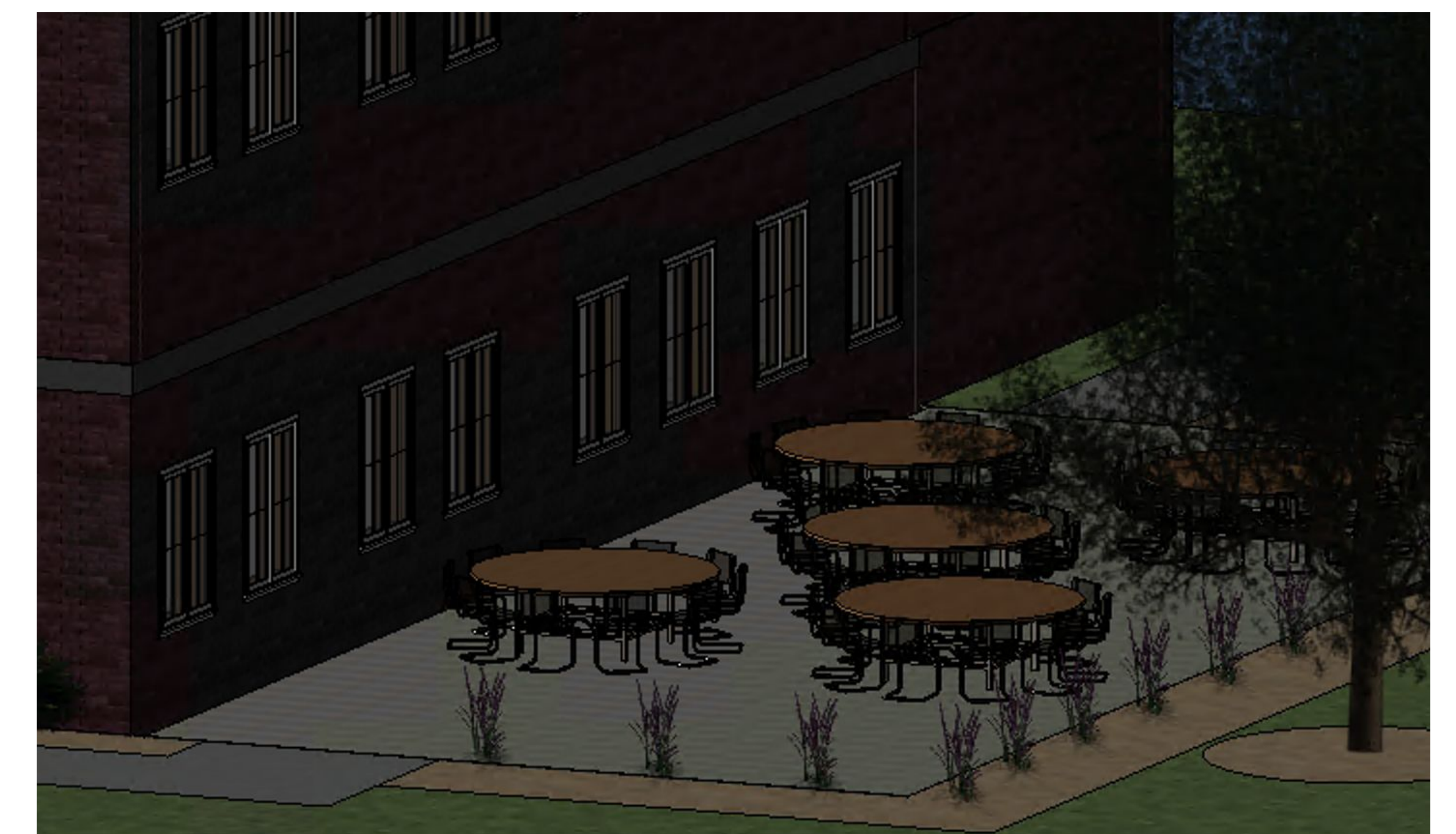
Figure 4. The outdoor patio addition used for receptions and community gatherings.

A large paver patio will be put together on the western edge of the school building for ceremonies, receptions, and community events.