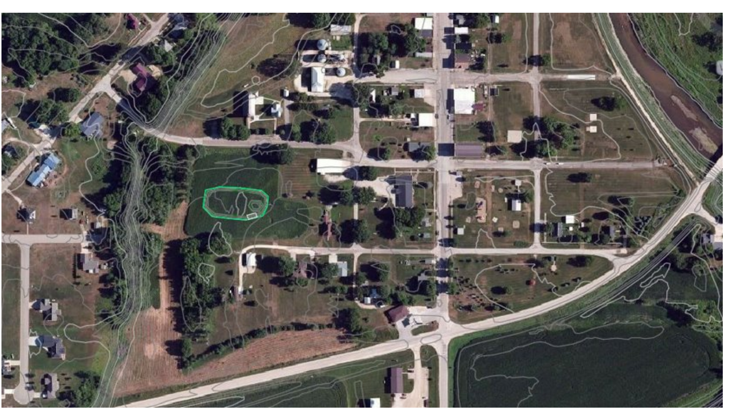
Figure 4.1 - Site Location of Constructed Wetland.

A constructed wetland is proposed as a solution to there possibly being a wetland on site. We proposed it in the southern region because the standing water does not cause any significant problems for residents. The wetland provides the residents more aesthetic appeal and bat houses are to be implemented to help with the mosquito problem. The wetland was oversized to account for sediment accumulation.