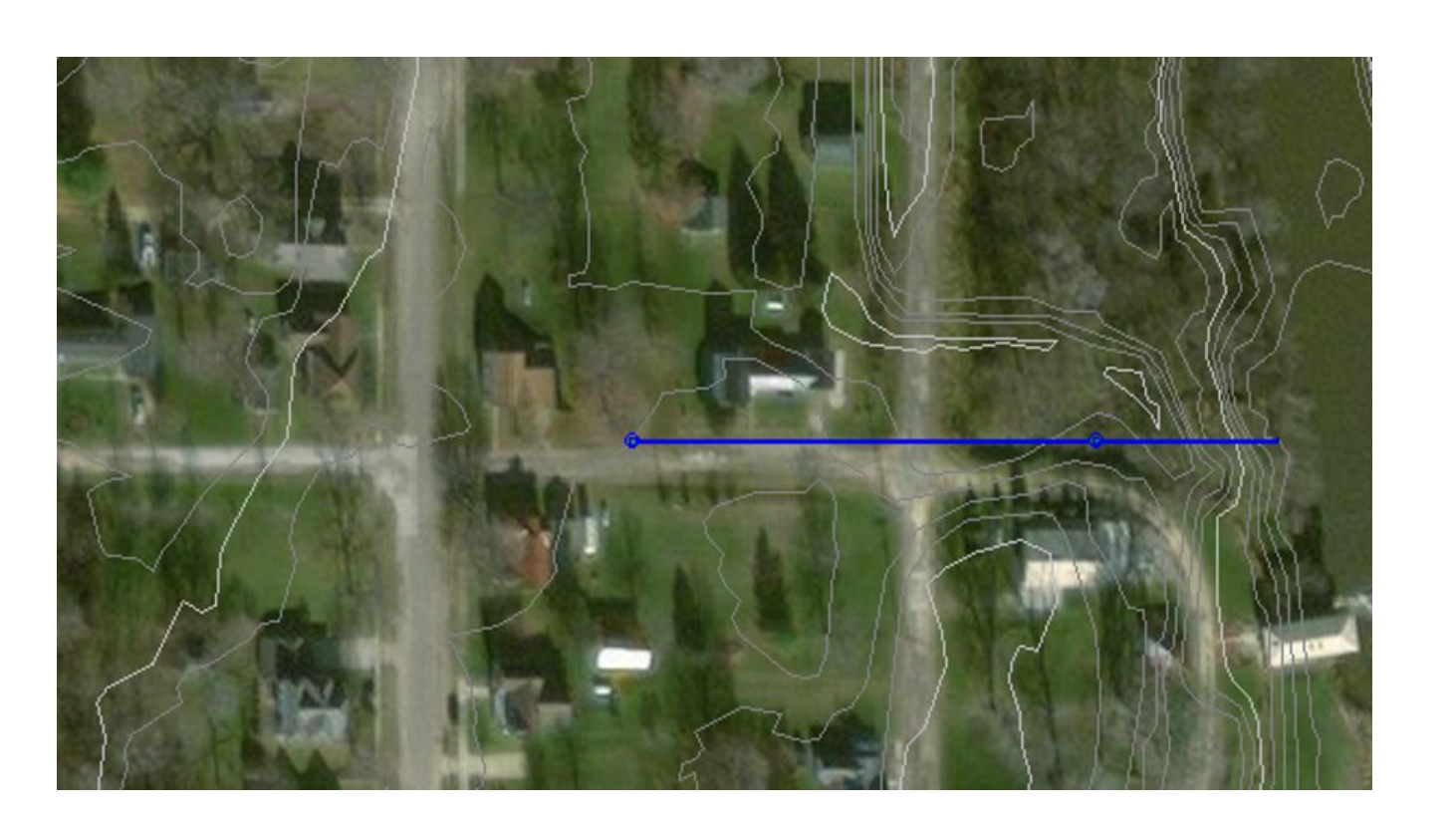
Figure 3.1 - Aerial of Site Location and proposed system

The proposed storm sewer on Volga Street servers the dual-purpose of helping get water out of an area that ponds in the town, while also diverting runoff from around 3 acres of property away from the two existing floodgates that serve the town currently. The design consists of two stormwater intakes and around 415 feet of concrete pipe. The Sewer was designed at a higher flood event than normal, so the city has the option to expand their system and as an extra factor of safety during the large events that Volga is prone to. This design works with another City of Volga team who are proposing to build a pedestrian bridge by the system's outlet.