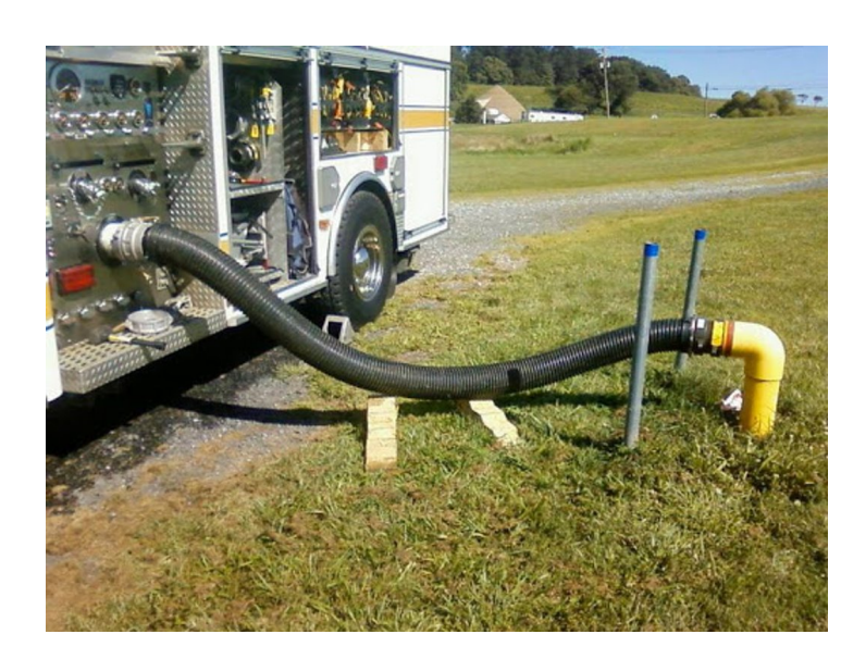
Figure 2.2 - Firetruck Pump Setup