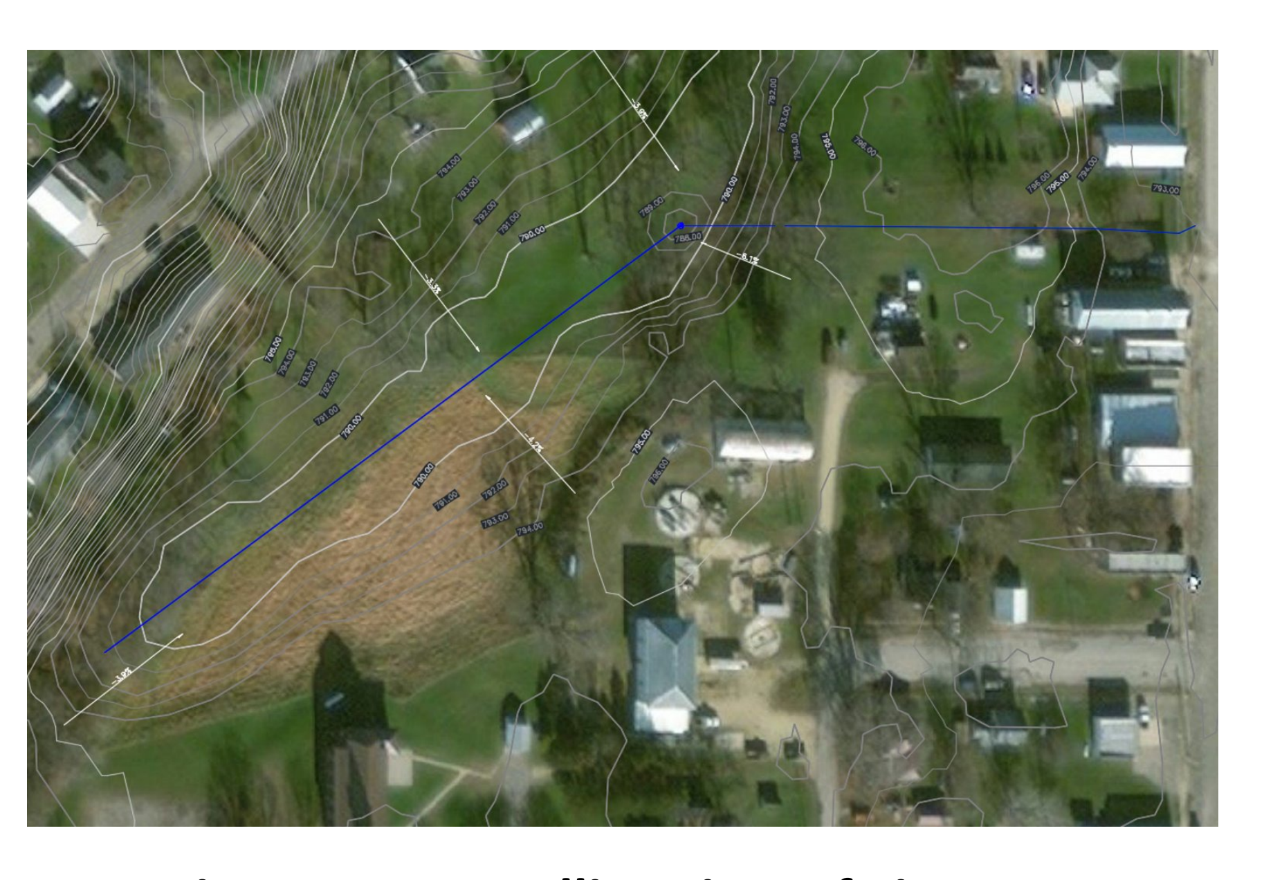
Figure 2.3 - Satellite View of Site Area