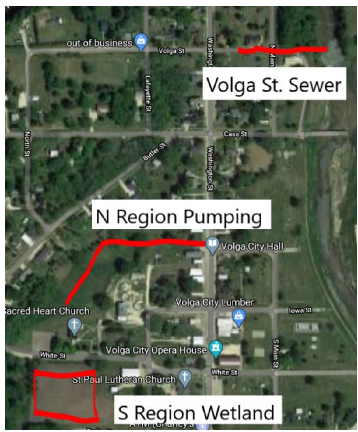
Figure 1.1 - Overview of sites

The city of Volga is a small town that experiences flooding during the rainy summer months. The City has a limited storm sewer system and there were many locations in the community that suffer during heavy rains. Our team worked with the City's staff and found that there were three specific sites that needed to be focused on. This includes two low-lying areas that retain water and cause flooding issues for residents, identified as the north and south regions. The other concern is a surface runoff problem on Volga Street.