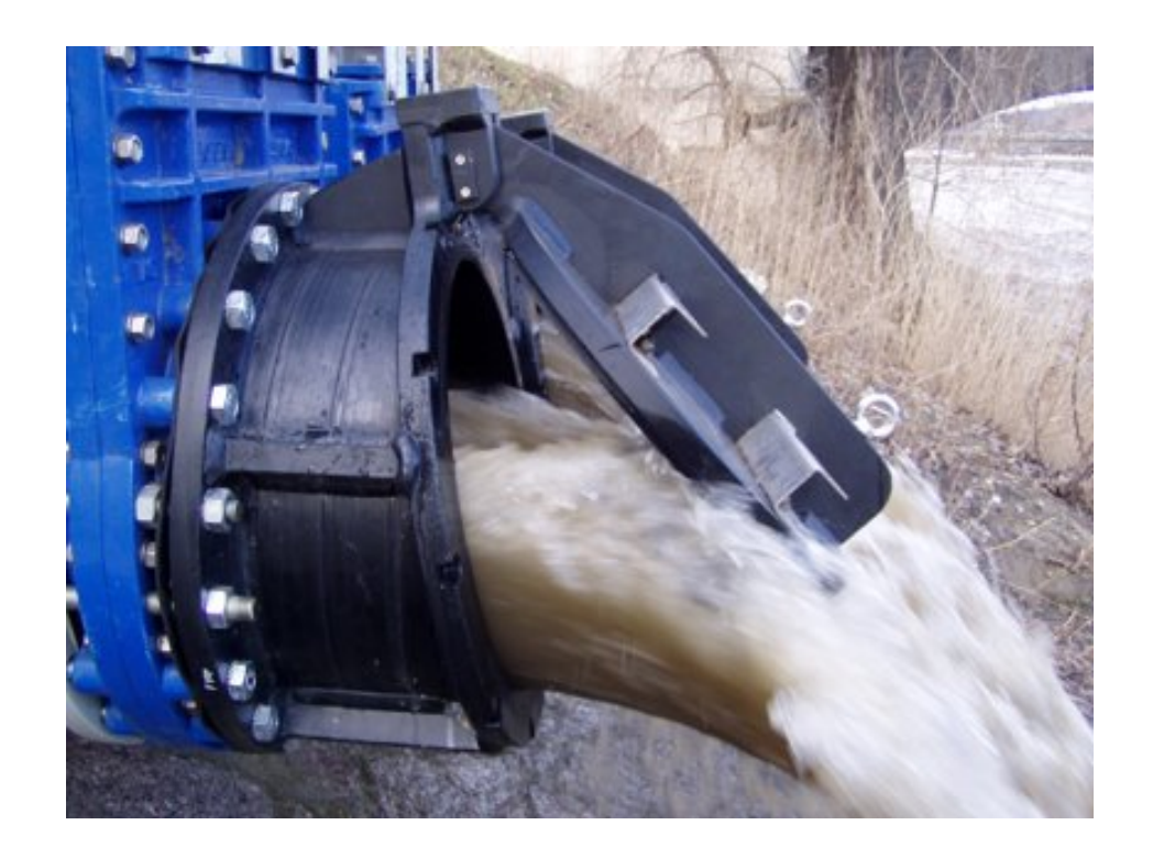
Figure 3.2 - What the Proposed Outlet will Look Like