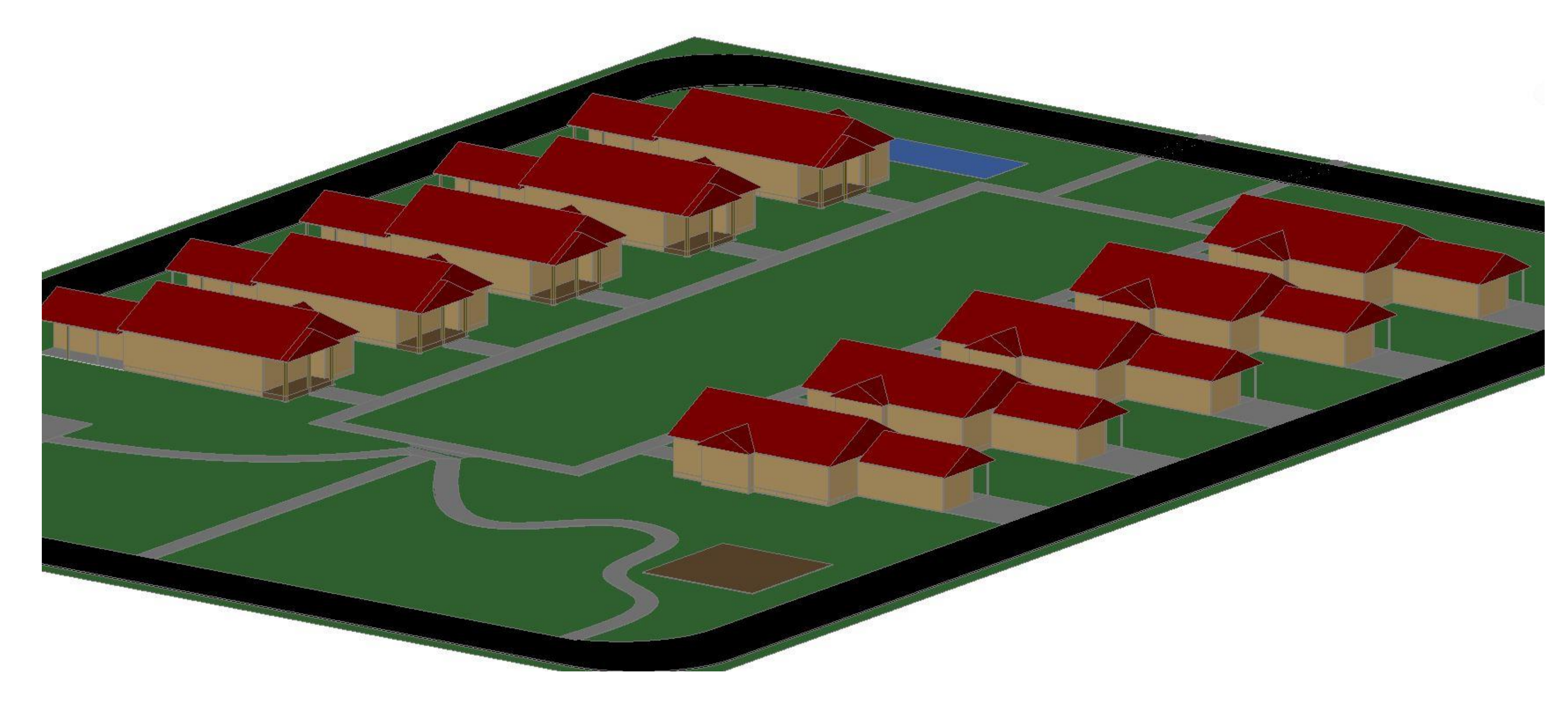
Figure 2. 3D Site Rendering.

Our team utilized a variety of modeling software such as Revit , Civil 3D , and ArcGIS to illustrate each aspect of the project. This includes storm-water drainage, trails and sidewalks, a garden and patio area, foundation, horizontal and vertical alignment, vehicle tracking, and overall home design.