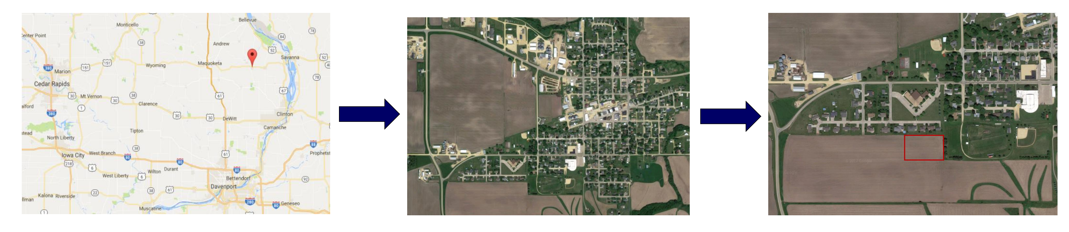
Figure 1. Location of Preston, IA and exact site location.

Our team was tasked with designing a residential neighborhood for the City of Preston, IA. The city is in the eastern part of Iowa and has a population of 1,000 people. Our site has an area of 3.25 acres and is located on the southwest side of the town. It is highlighted in the red box in Figure 1 below. It is currently used as farmland but has been bought by the city for development.