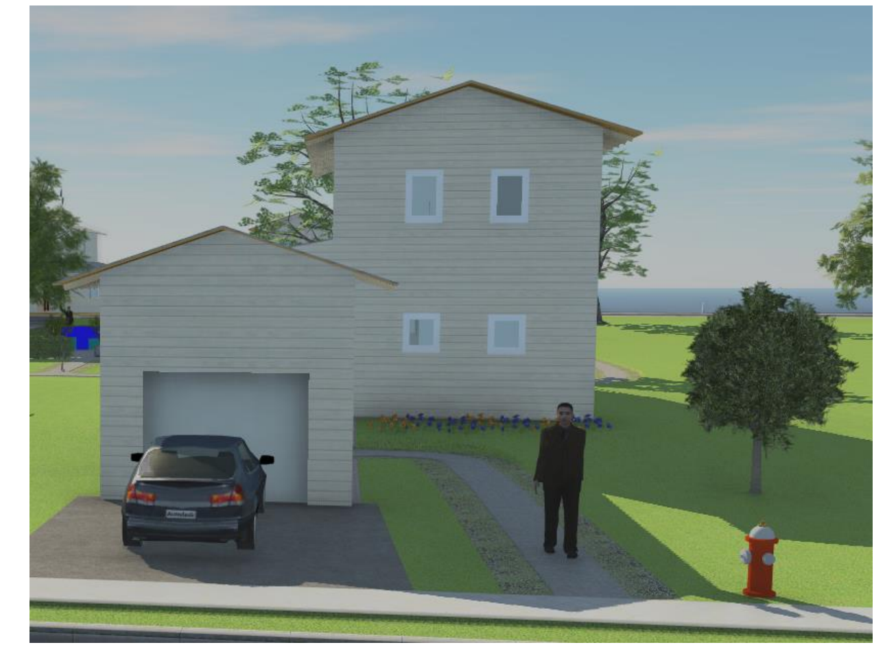
Figure 5: Rendering of 2-story house (with garage)