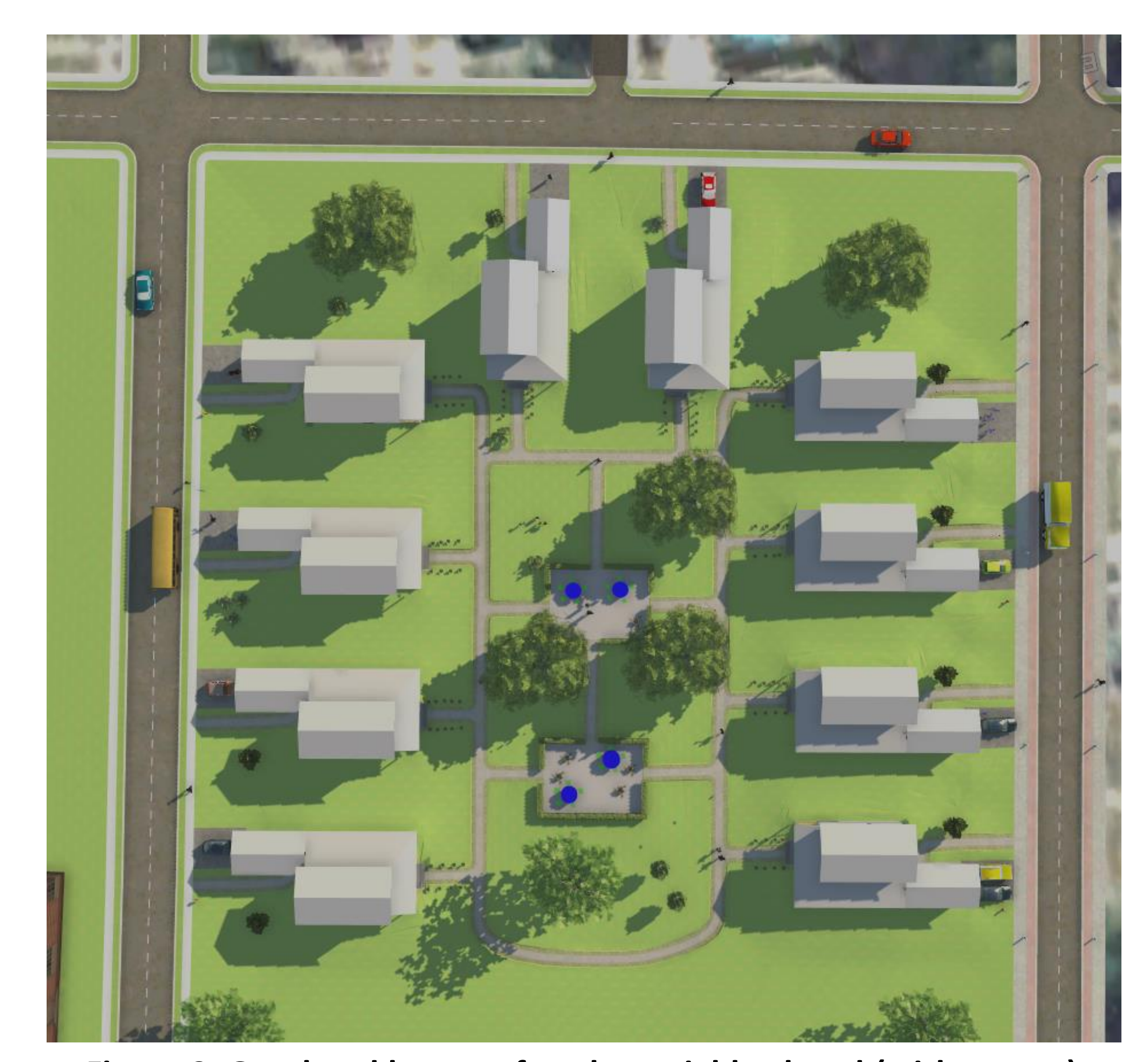
Figure 2: Overhead layout of pocket neighborhood (with garage)

An outside the box idea, this arrangement of houses around a shared common space will foster neighborhood interactions while maintaining a level of privacy for the homeowners.