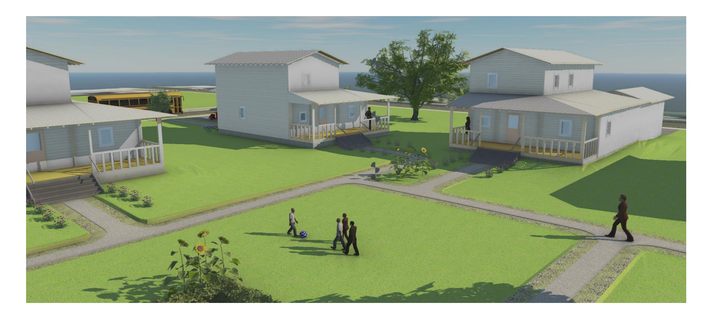
Figure 6: Renderings of pocket neighborhood

References: ASCE 7-22, Design Specification for Wood Construction (NDS 2018), Clinton Code Ordinances, International Building Code (IBC)