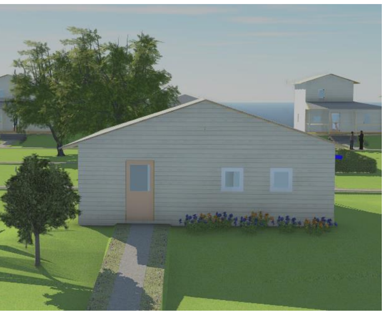
Figure 3: Rendering of 1-story house (without garage)