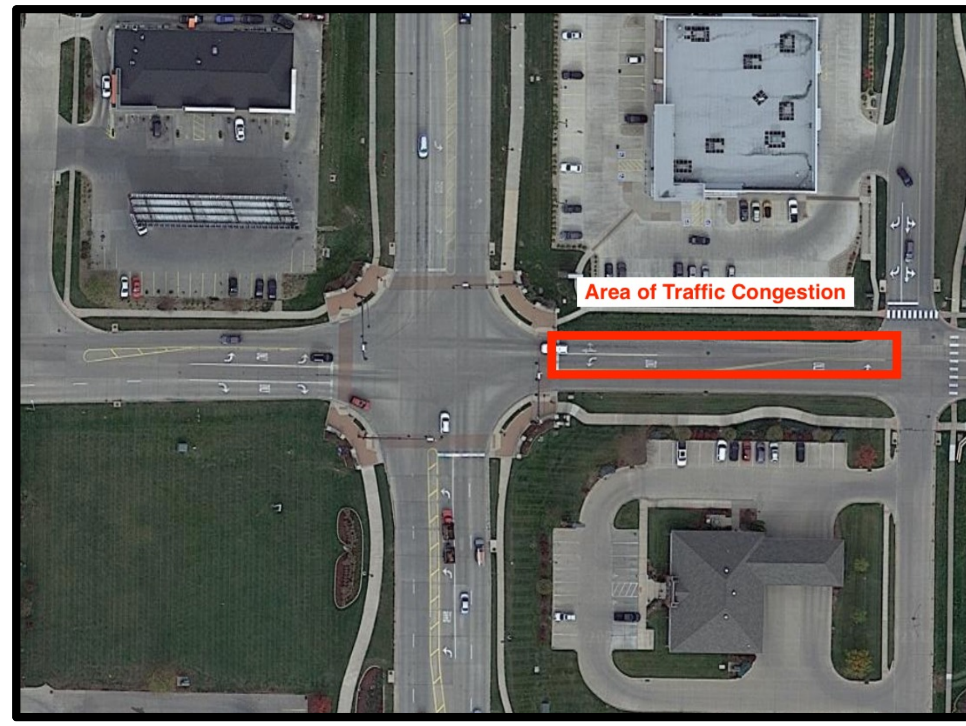
Figure 1. Location of Traffic Congestion.

A traffic study was performed on Penn Street & Ranshaw Way corridors to evaluate the effects on the transportation network. The figure below shows the site's location in North Liberty and highlights the areas experiencing traffic congestion during peak morning hours.