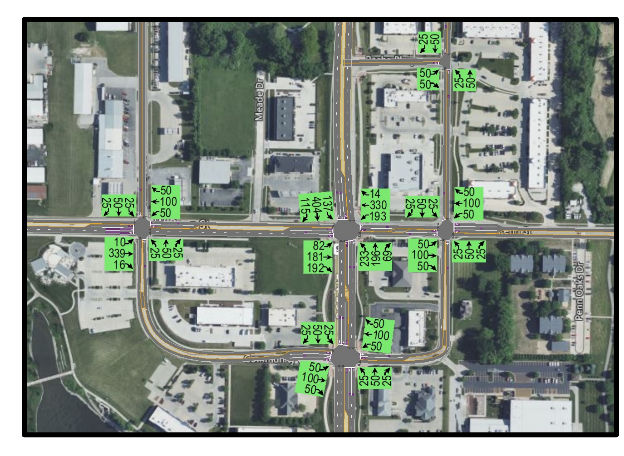
Figure 2. Synchro model.

Our goal is to alleviate the existing traffic build-up that occurs in the morning in Penn Street without impacting the rest of the network. We utilized advanced traffic optimization software, known as 'Synchro', which uses the capacity analysis from the Highway Capacity Manual to conduct an analysis of the transportation network in order to reduce the delays and increase the overall level of service for the intersection..