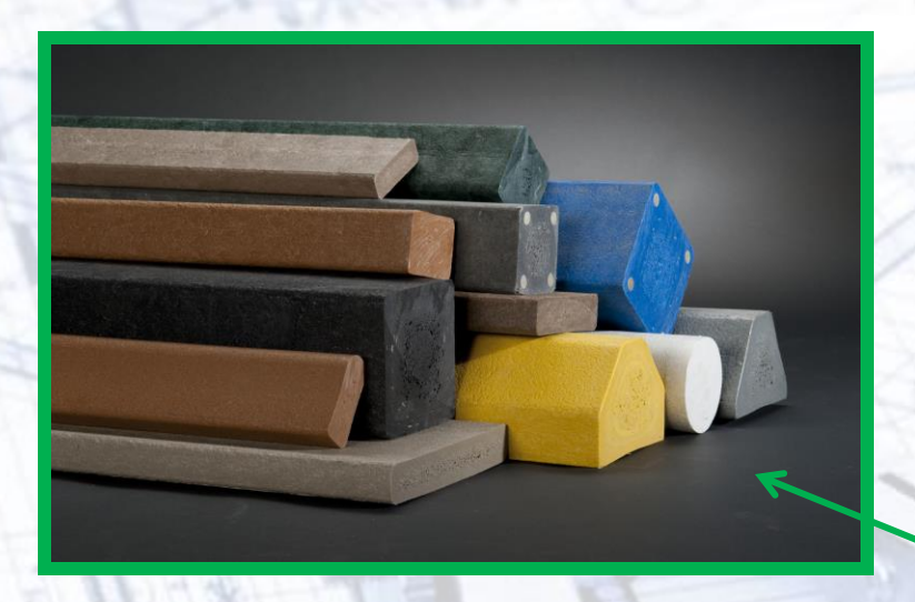
Recycled and Composite Materials