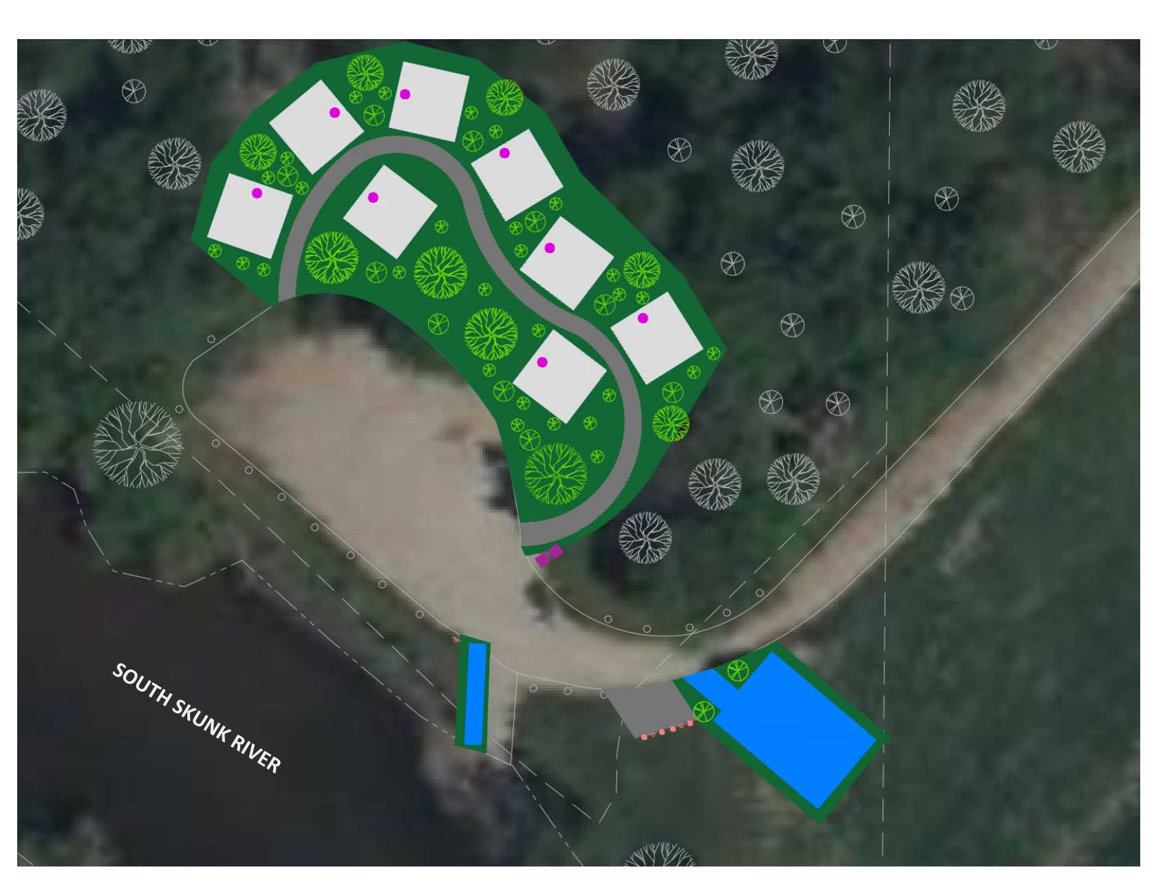
Figure 3.Glendale Access Site Design

Each site location contains unique amenities purposefully designed to provide convenience and comfort for visitors. These amenities include improved parking areas, non-motorized boat launches, bathrooms, shaded communal structures, garbage receptacles, and primitive campsites. Additionally, the sites will include landscaping that has been implemented to fit into the natural environment, creating an inviting and relaxing atmosphere.