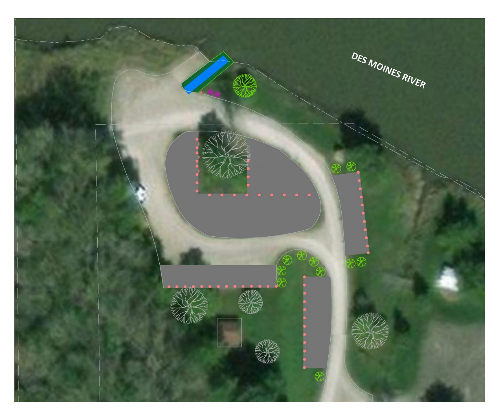
Figure 5. Eveland Access Site Design