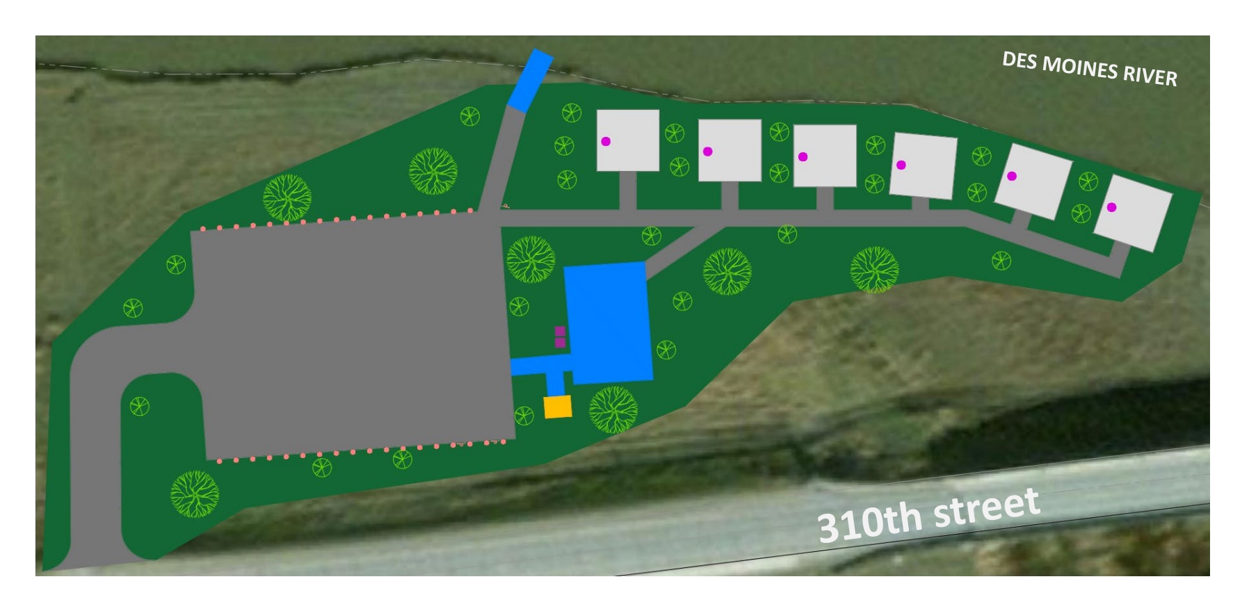
Figure 6. 310th St. Site Design

Accessible Parking Spaces. (n.d.). In ADA.gov. Retrieved March 31, 2024, from