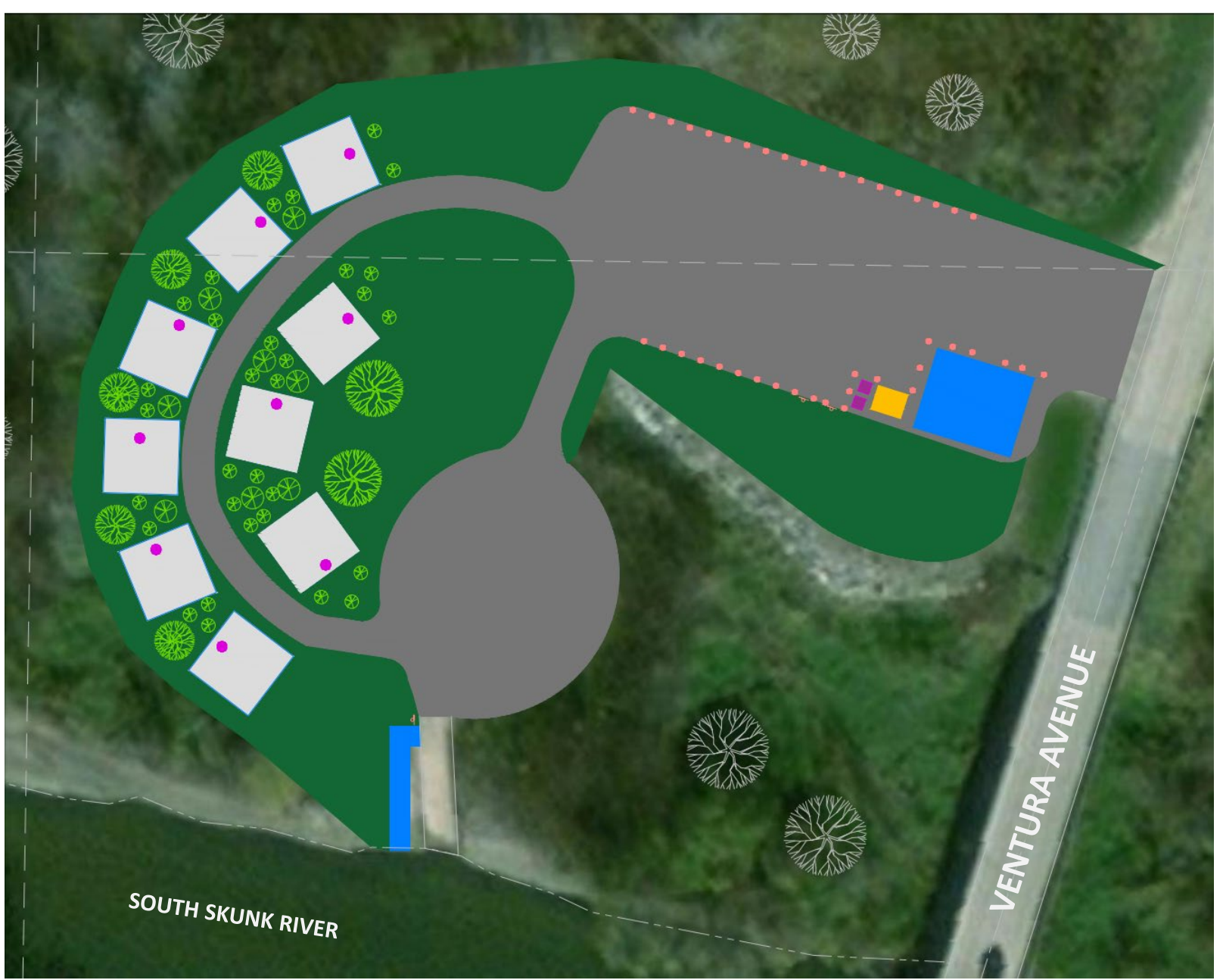
Figure 4. Rose Hill Access Site Design