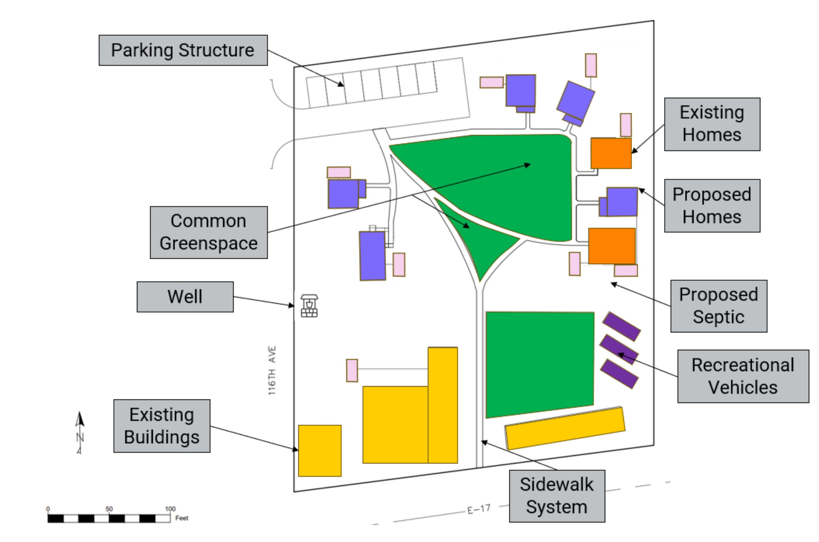
Figure 1. Drawing of the Proposed site plan.

The Scotch Grove Ecovillage is located at 11726 Co Rd E17. This project will provide a new community space and new housing to the core district of Scotch Grove, creating an integrative space for all members of the community. A portion of existing structures on the property will be demolished which will provide room for the green space.