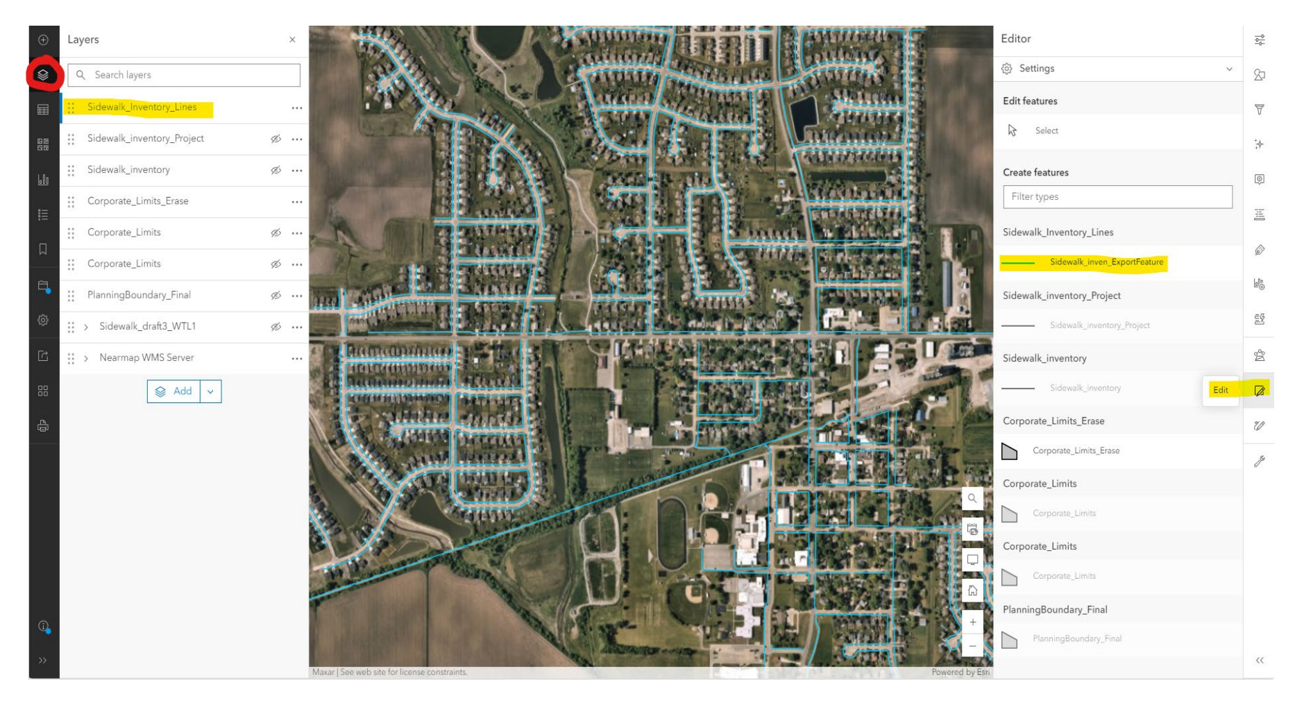
Figure 1: Interface of sidewalks Web Map. Clicking the highlighted "Sidewalk_inven_ExportFeature" allows the users to add lines over new sidewalks.

In the same Editor tab, users can also select current sidewalks with the 'Select' tool. This brings up the attributes of the selected sidewalk, including the added sidewalk width, type, and condition. These can be easily edited by clicking the field.