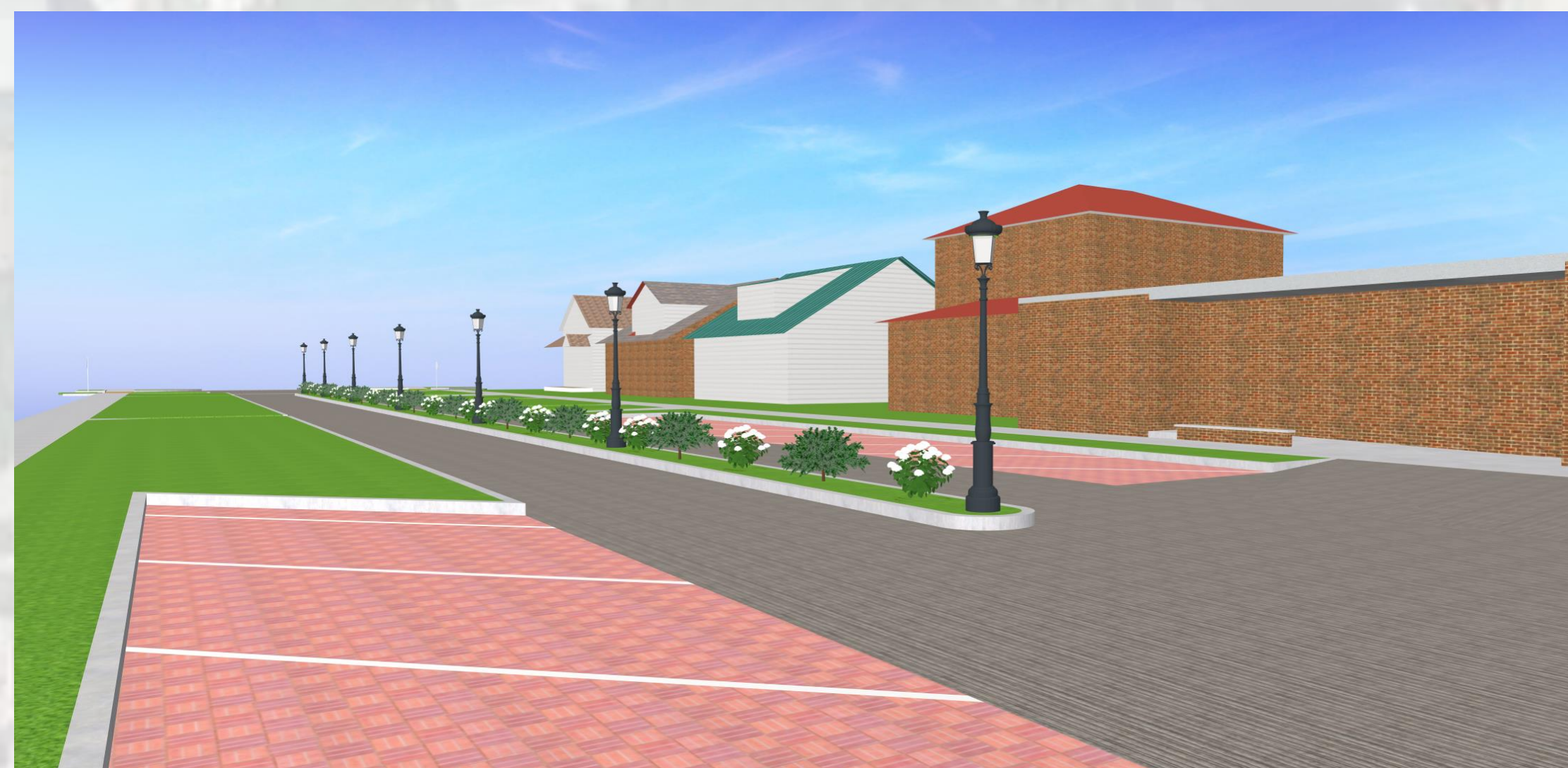
Figure 3 - SketchUp Rendering of the Road Design South of Wheeler Street

The roads to be redesigned include Broadway Street and Wheeler Street. The planned improvements will feature a median, a reconfigured parking layout featuring back-in parking, enhanced lighting, and increased visual appeal. The most significant change will be the addition of the median, which is designed to seamlessly integrate with the downtown area. This modification will maintain functional lane widths while also enabling better lighting and the introduction of greenery, such as trees and plants, to enhance the downtown environment.