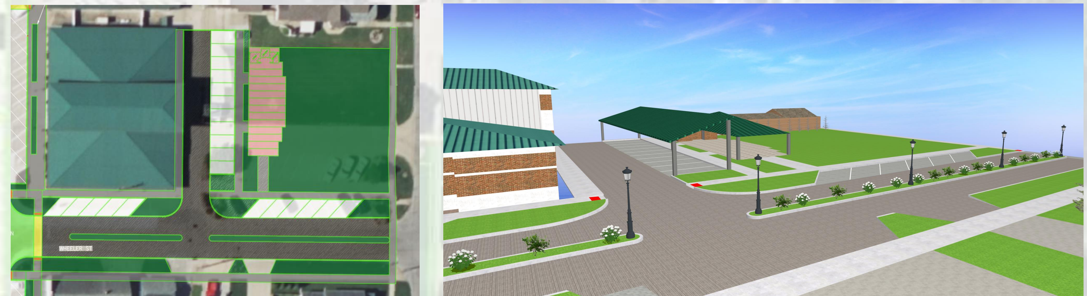
Figures 4 and 5 - Civil3D Layout of the Lot Development and SketchUp Rendering of the Lot

The vacant lot east of city hall will be developed with new parking, a parking overhang equipped with solar panels, and an adjacent structure providing a community event space. This area will allow room for events like Farmer's Markets and the 4th of July Festival. A small building is proposed on the north side of the community space giving the City room for mixed-uses and public bathrooms.