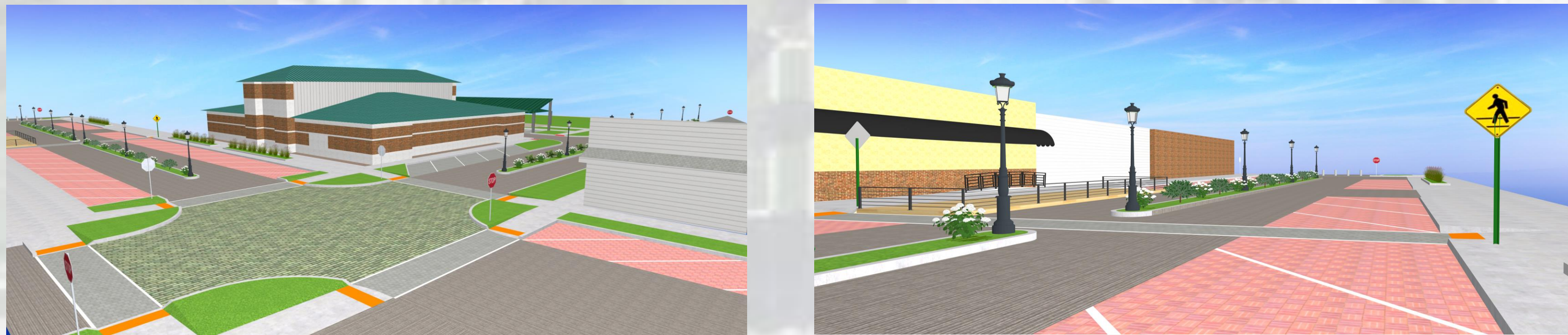
Figures 1 and 2 – SketchUp Renderings of the Intersection of Broadway Street with Wheeler Street and Broadway Street north of Wheeler Street

Three students from the University of Iowa were tasked with redesigning the downtown area of West Burlington, focusing on improving functionality, visual appeal, facilitating public events, and attracting visitors. The project's scope spans Broadway Street and extends into the vacant lot behind City Hall, providing an excellent opportunity for creative and impactful development in the downtown area. Key improvements include a 4-foot median along Broadway Street, a reconfiguration of parking, a redesign of the Broadway and Wheeler intersection, and the creation of a Farmers Market on the east side of City Hall. These enhancements will improve walkability, foster a better environment for community events such as the 4th of July celebration, and create new spaces for the community to enjoy and utilize.