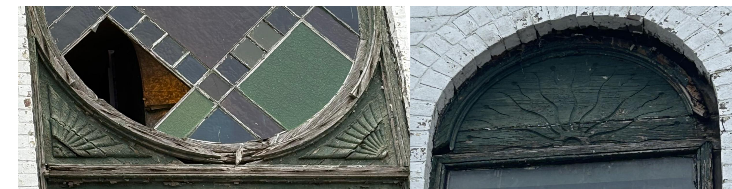
Stained glass above original church entrance

Other existing elements that could be displayed on walls or on site