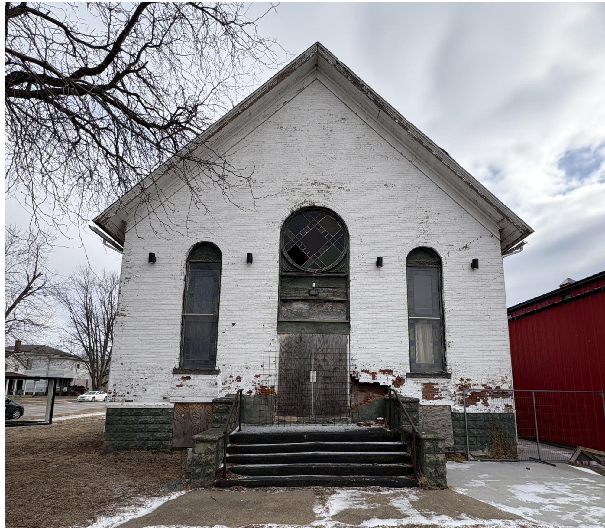
303 S 3rd St, Clinton, IA