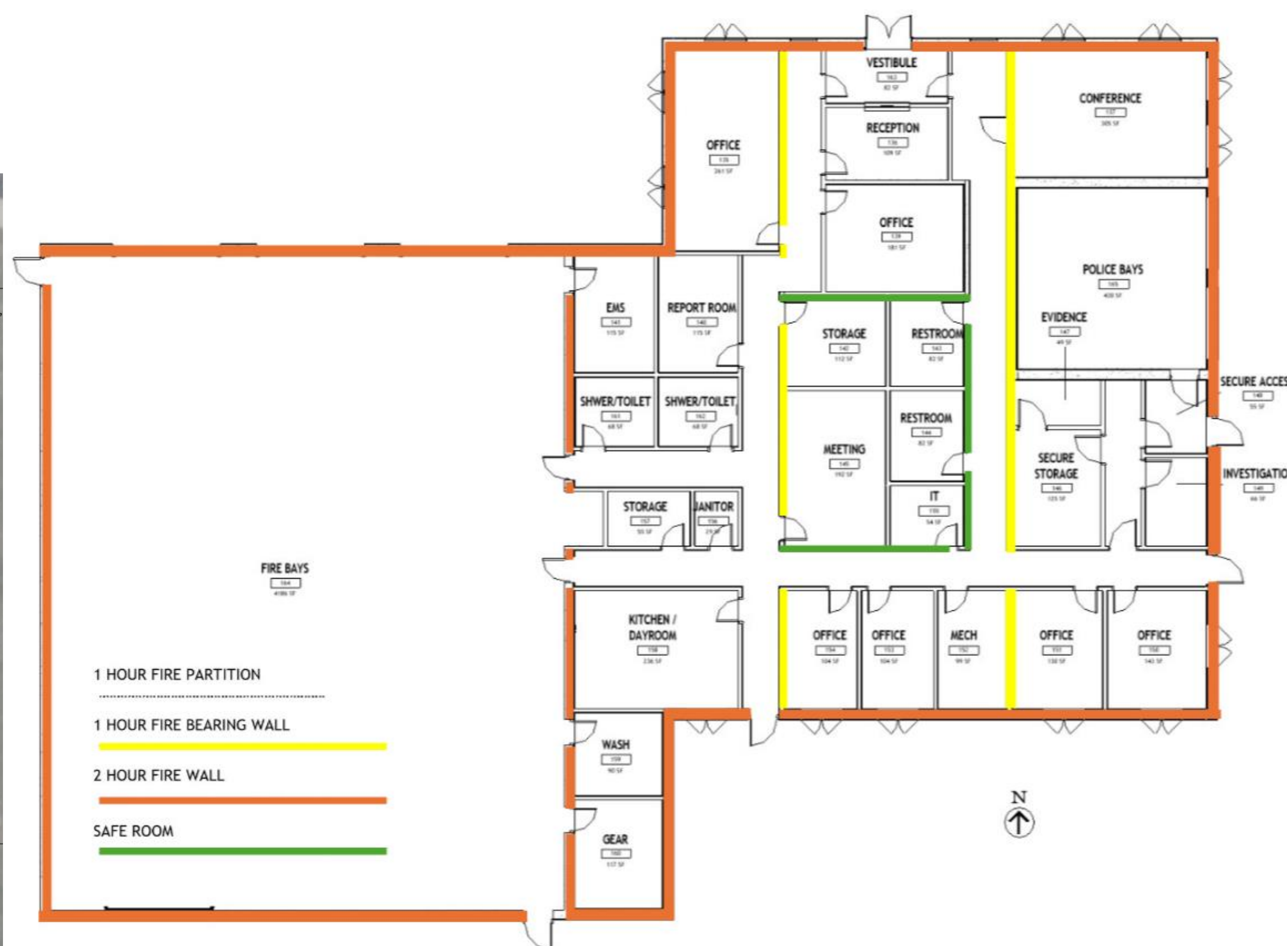
Architectural Plan with fire code and safe room

The apparatus bays were grouped into a single, 18-foot-tall space on the West side of the building. This keeps high-activity, vehicle-based functions isolated from the administrative spaces. Fire/EMS support spaces (gear storage/decontamination), are adjacent to the apparatus bays. Two police bays on the East and includes secure areas like evidence storage and investigation rooms placed to maintain restricted access. City Hall and public-facing spaces are more centralized and accessible, with reception near the main entrance to guide visitors. There is dedicated storage for each department, and flexible spaces for operational changes. The design incorporates a hot, warm, and cool zoning strategy that helps reduce cross contamination throughout the building and improves overall safety for occupants. A hardened safe room, based on the FEMA P-361 recommendations, is proposed for the center of the administrative area. This safe room has the capacity to protect roughly 160 people during an EF-4 tornado.