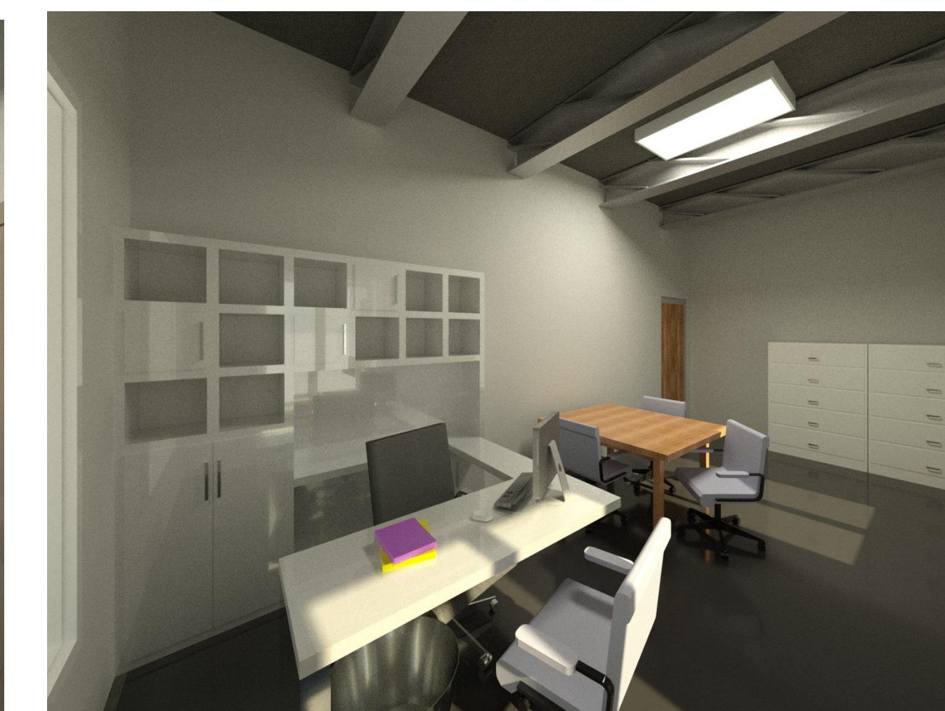
City Hall office space