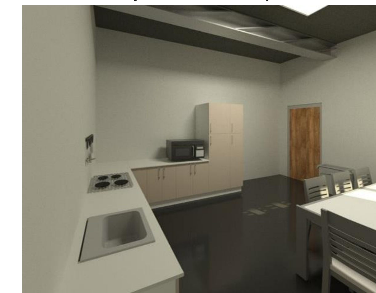
Kitchen / Day Room