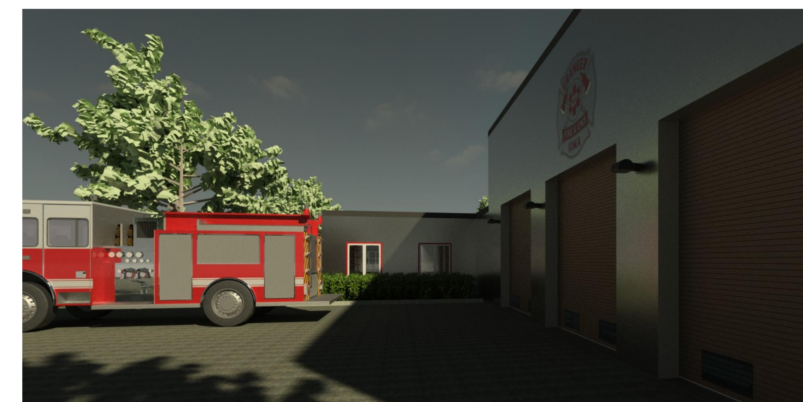
Exterior isometric view facing West

The structural system selected for this facility was comprised of precast concrete bearing walls supporting a structural steel roof system. These materials were selected since they provide a durable, cost-effective, structure with the strength to resist the larger loads required of an emergency response facility. The superstructure is supported by a shallow foundation system embedded 3'-6" below finish grade. The apparatus bays required a 6" thick reinforced concrete floor slab to support the weight of the Fire/EMS vehicles. In addition, long-span steel joists were utilized for the apparatus bay roof system so the bays would not be obstructed.