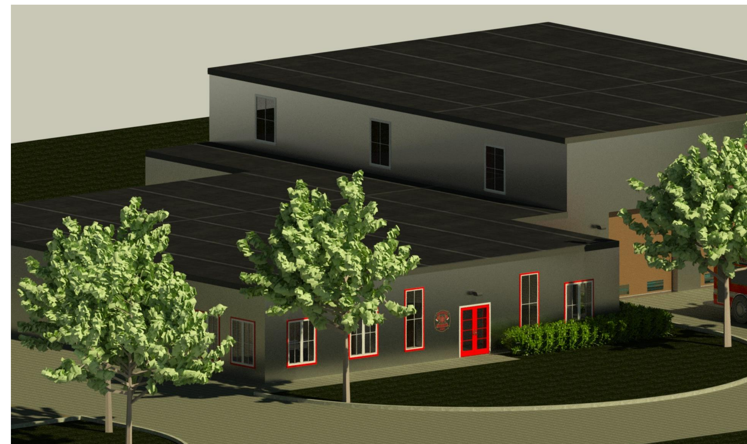
Exterior isometric view facing Southwest